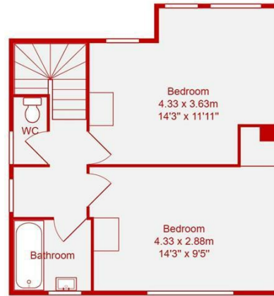
First Floor Area: 38.0 m 2 ... 409 ft 2